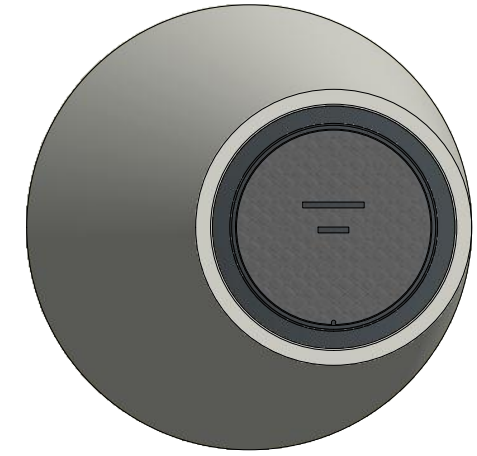
PLAN VIEW NOT TO SCALE